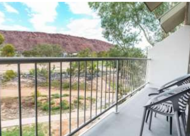
Tue 15 October - 5:50am - Transfer from Alice Springs to Ayers Rock (5 hours)